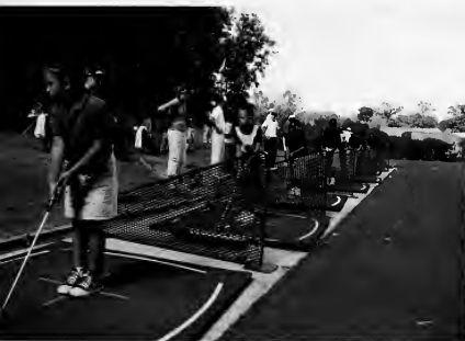
Drew students learn from Oglethorpe players