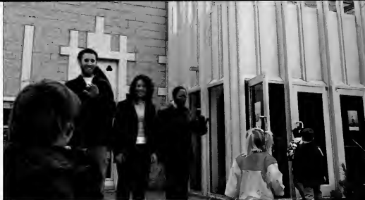
The center staff greets students from local elementary schools before You Are Special .