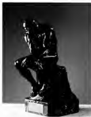
Rodin's The Thinker